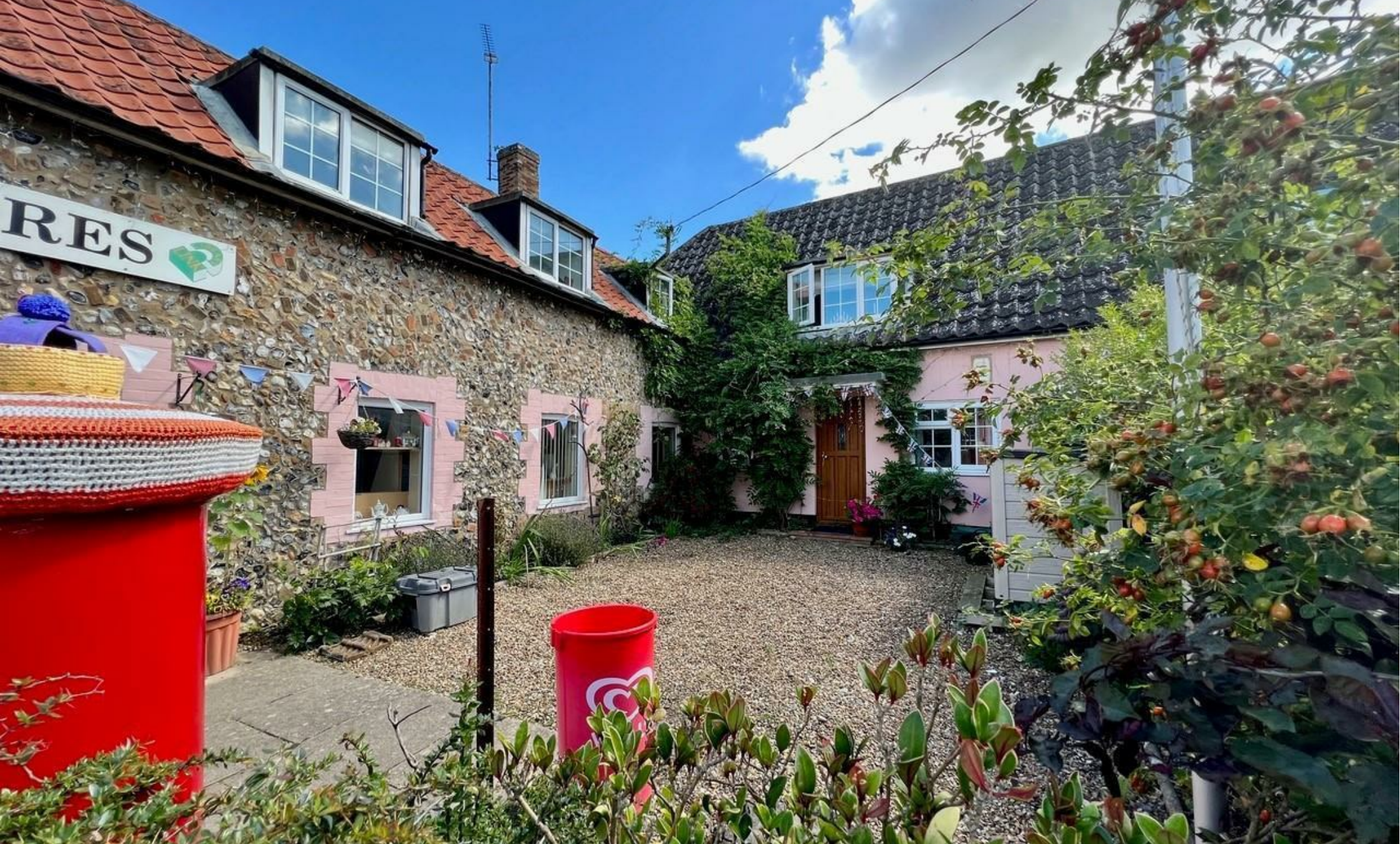
Old Post Office House The Street Bury St. Edmunds, Suffolk IP31 1NG Guide Price £365,000